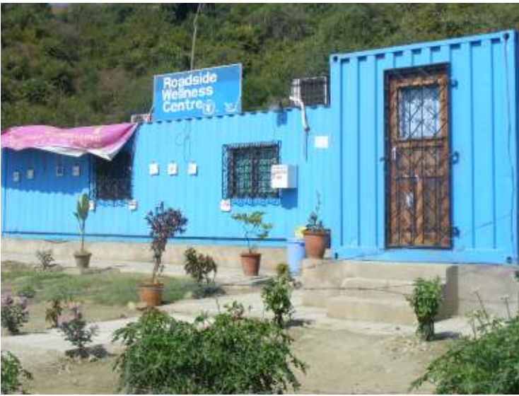
The Wellness Centre at the Kenya Ports Authority

The PMAESA Secretariat will intensify the drive to curb HIV AIDS by setting up more wellness centres in the regions ports and corridors.