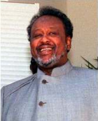
Djibouti President, Mr. Ismail O. Guelleh

Read the latest edition of Our Ports PMAESA's Official Magazine Online: www.pmaesa.org