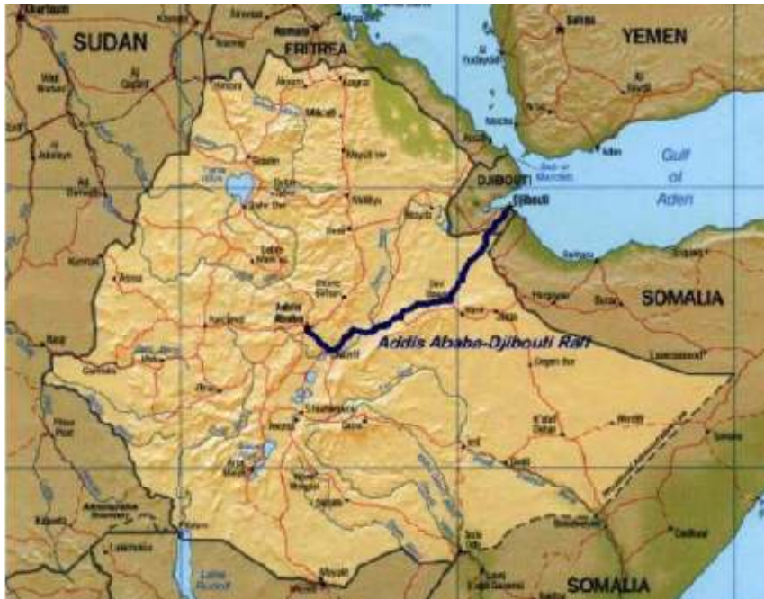
The Addis-Djibouti railway line

Ethiopian Prime Minister Meles Zenawi tackled the