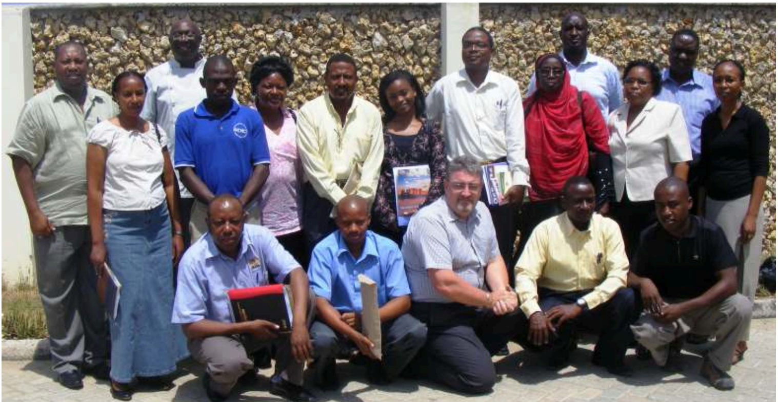
The delegates pose for a picture after the stakeholder's meeting.

Distance Truck Drivers Association, World Food Programme (WFP), the Ministry of Health and Medical Services as well as Kenya Ports Authority.