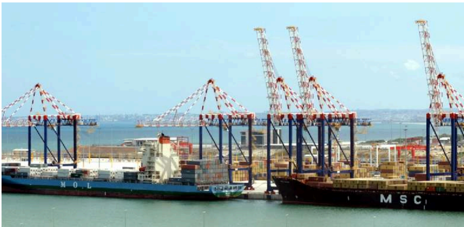
The quay-side at the new Port of Ngqura

Just four months after its inauguration, the new port of Ngqura is making significant strides in the transshipment market in South Africa and the region.