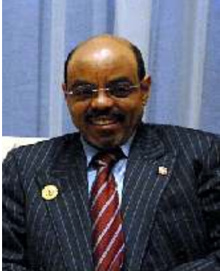
Ethiopian Prime Minister, Mr. Meles Zenawi

The Addis Ababa-Djibouti railway is part of the government's plan to lay down 5,000 km of track along seven different routes of economic importance. The next phase will see another track linking Ethiopia to Kenya.