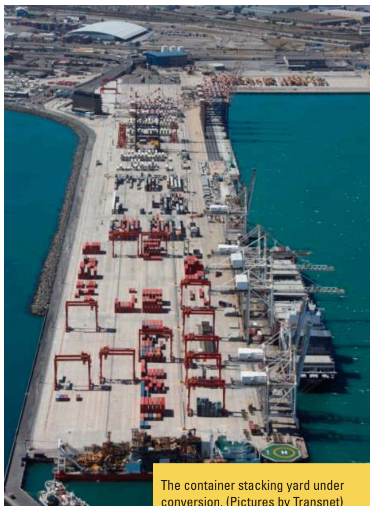
The container stacking yard under conversion.

containers high and 30 deep - thereby providing better utilisation of space. These converted RTG blocks boast stacking capacity of 6900 TEU (twenty foot equivalent unit) slots in total, presenting an increase in stack-