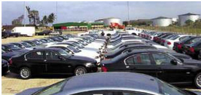
Maputo Port vehicle yard