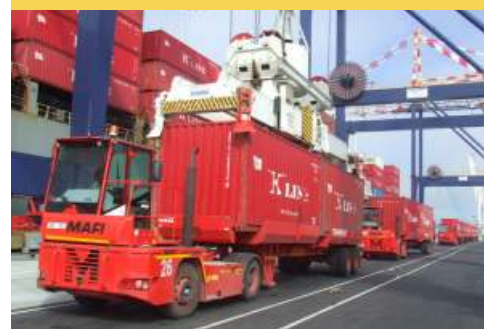
A picture of some of the hauliers

To date 69 Operators for Lifting Equipment (OLEs) have been trained and signed off as competent - 43 on the Liebherr twin lift cranes and 26 on the Kalmar RTG's.